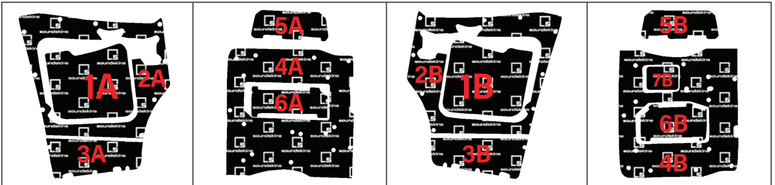
Driver Front Door Pieces