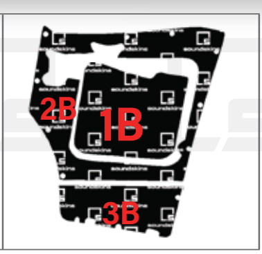
Driver Front Door