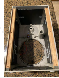
Speaker Boxes for Home Audio/Theaters