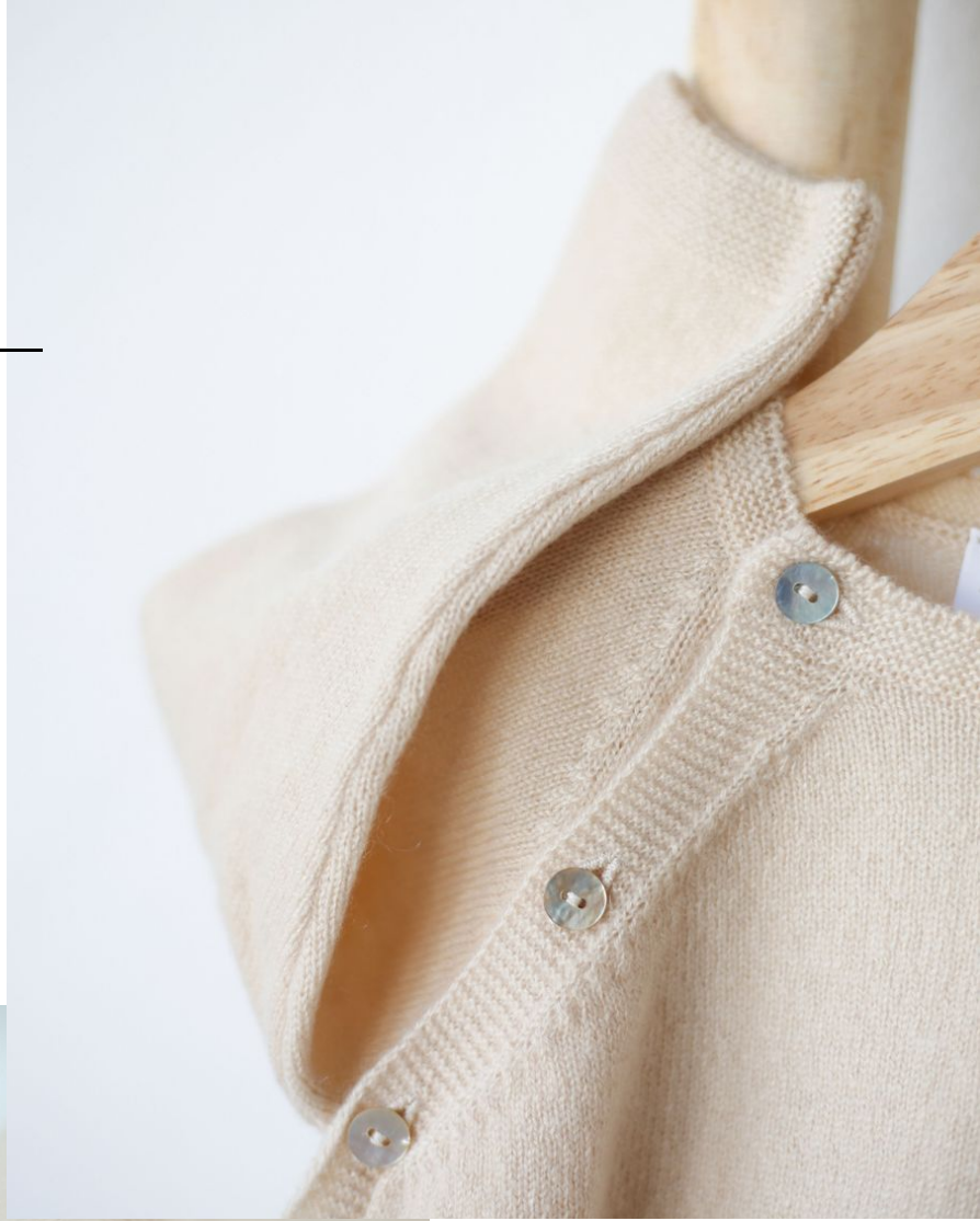
Classic Cardigan "Roma" with noble pearl buttons