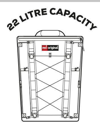
L: 450mm W: 350mm H: 200mm