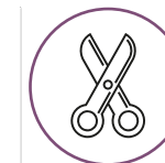
Rips, Tears, Cuts