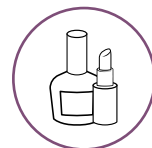
Nail Polish, Lipstick