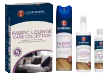
Small Fabric Care Collection Kit. Products provided only with self-application warranties