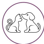
Pet Bodily Fluids