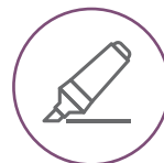
Pen, Ink, Marker