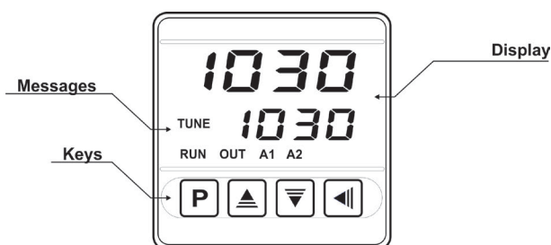
Fig. 02 - Identification of the parts referring to the front panel

The controller's front panel, with its parts, can be seen in the Fig. 02: