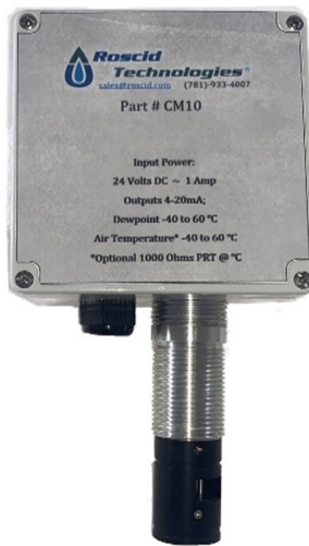
Wall Mount Configuration