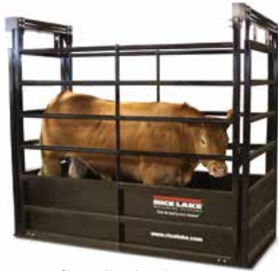
Shown with racks and gates