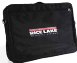
Optional Transport/Carrying Case