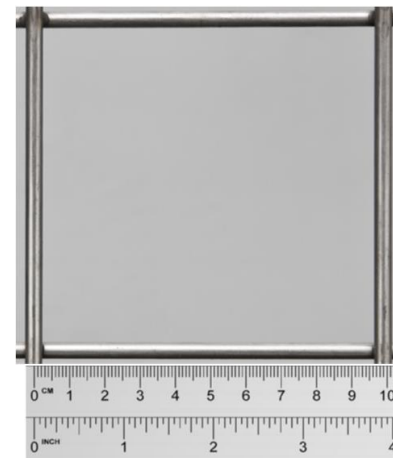
100mm x 100mm