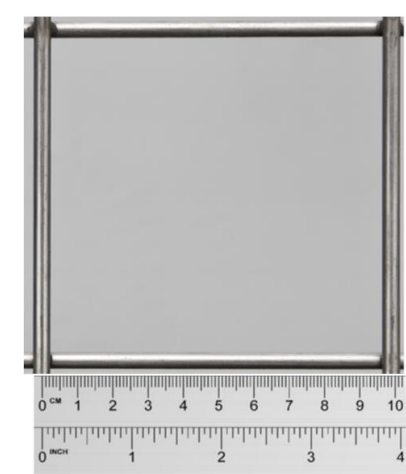
100mm x 100mm

· We can also supply Woven mesh & Perforated sheet