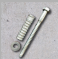
5" Expansive Screw Concrete