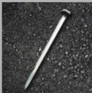
14" Steel Spike Asphalt