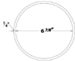
Cross Section of Sleeve

Steel Pipe ID = 6" Steel Pipe OD = 6.625" Ideal Sleeve ID = 6 7/8"