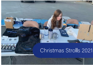
Christmas Strolls 2021