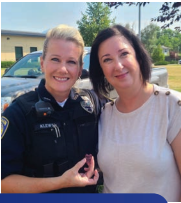
2021 First Responder Car Wash