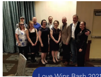
Love Wins Bash 2021