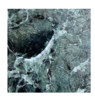
Verve Alpi Pulido Brillado