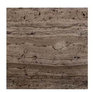
Marmol Wood S