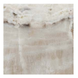
Traonix Paulido Brillado Traslucido