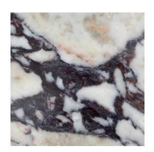
Calacatta Viola PB