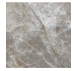
Taj Mahal Leather Quartzite