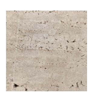
Marmol Travertine Navona Spazz