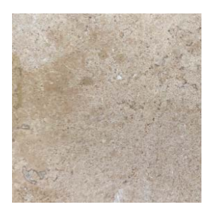
Travertine San Pablo PB