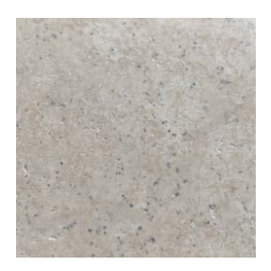
Travertine San Pablo Spazz