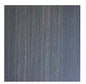
Streaked Blackened Bronze