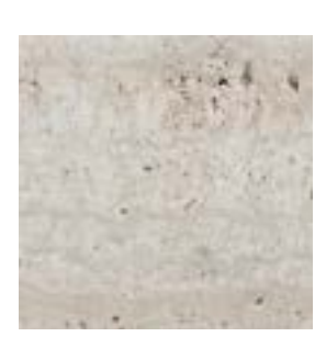
M Travertine Silver