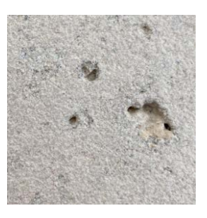
Fiorito San Blas