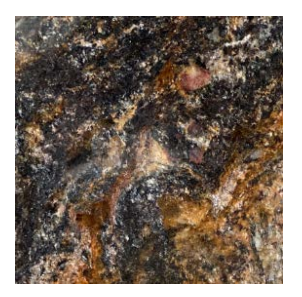
Q Metalicos PB