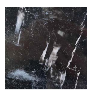
M Negro Monterrey