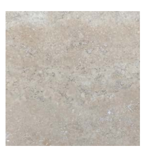
Travertine Navona P-B