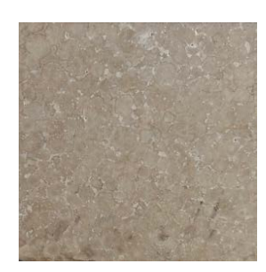
Travertine San Pablo Honed