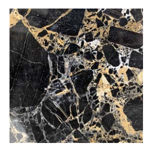
Portoro Gold RD Pulido Brillador