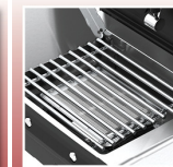
Powerful Infrared Side Burner