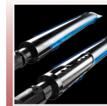
Stainless Steel Dual-Tube™ Burner System