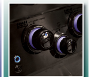
Built In Control Panel Lights