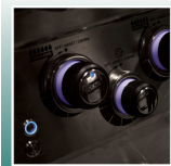
Built In Control Panel Lights