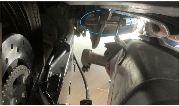
Figure 7 Figure 8