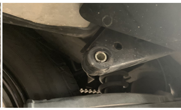
Figure 9 Figure 10