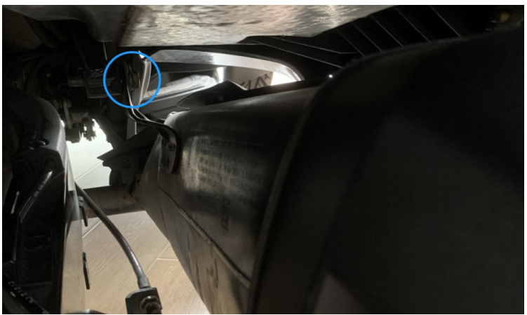
Figure 5 Figure 6