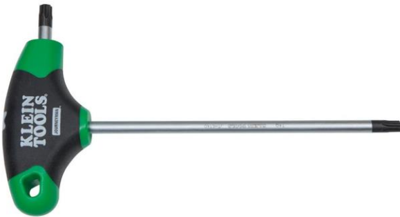
TORX Hex Key Set (T25/40/45/50) & Socket Set