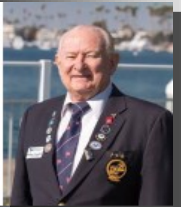
Commodore Rodney Coomber