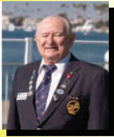
Commodore Rodney Coomber