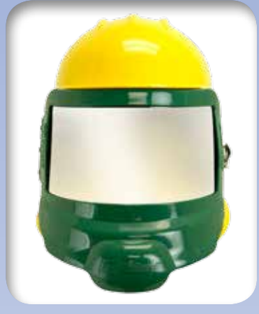
Clear Outer Lens Available in .015" or .040"