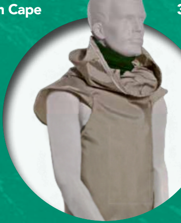
38" Length "Golden Gate" Nylon Cape