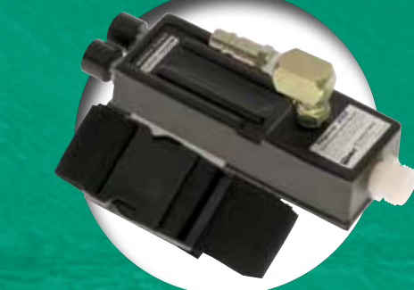
Frigitron 2000 (For use with Bullard Ambient Air Pumps)