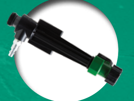
HCT Hot/Cold Tube