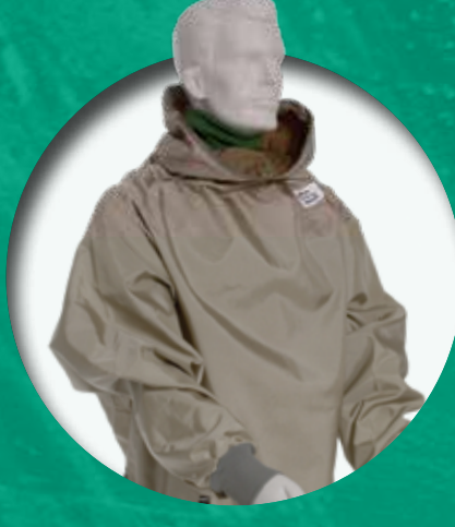
38" Length Hibernia Parka