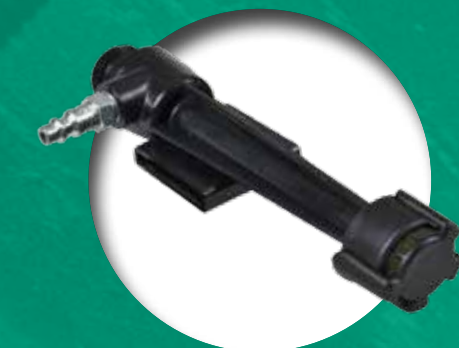
CT Cool Tube