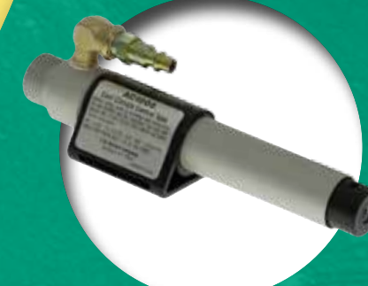
AC1000 Cool Tube