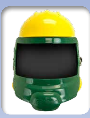
.040" Smoke Tinted Outer Lens