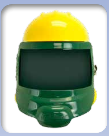
.040" Green Tinted Outer Lens