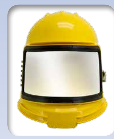
.040" Clear Inner Lens