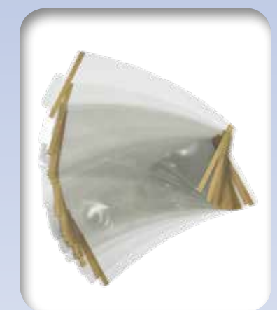
Adhesive-Backed Mylar<sup>®</sup> Lens Covers