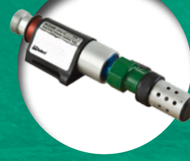
HC2400 Hot/Cold Tube