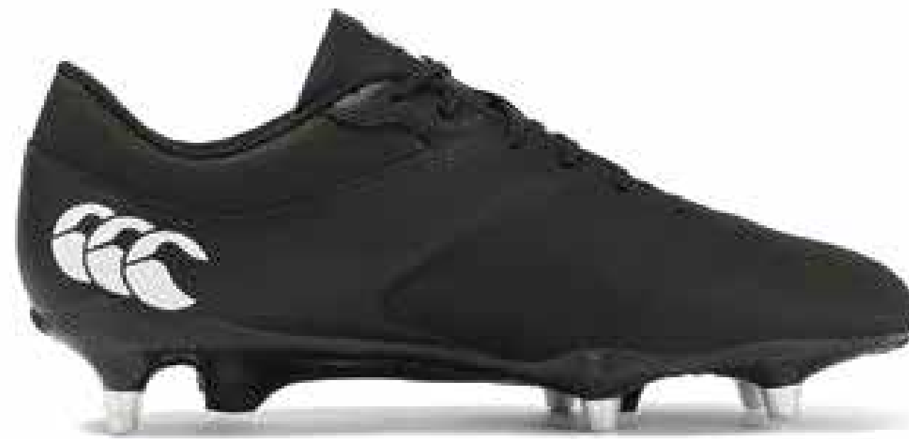
CCC PHOENIX RAZE SG AU BLK/WHT SKU: Q-E22A002090 Retail: $127 CAD