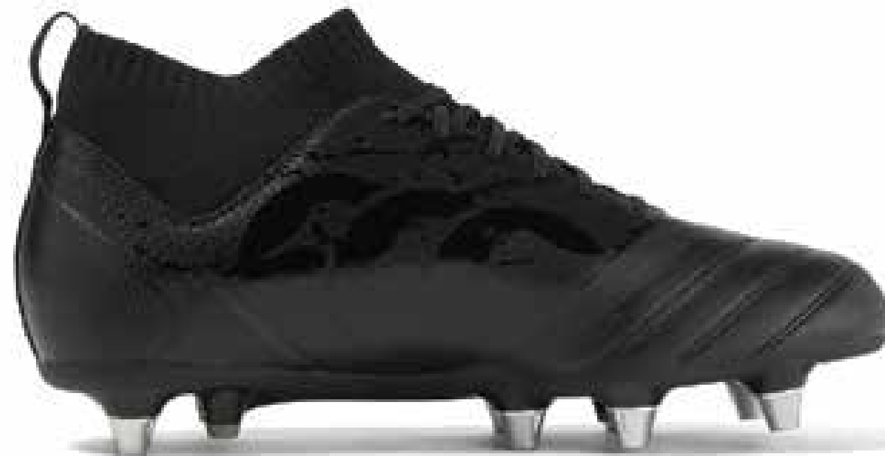
CCC STAMPEDE PRO SG AU BLK/GRY SKU: Q-B000071AP7 Retail: $191 CAD