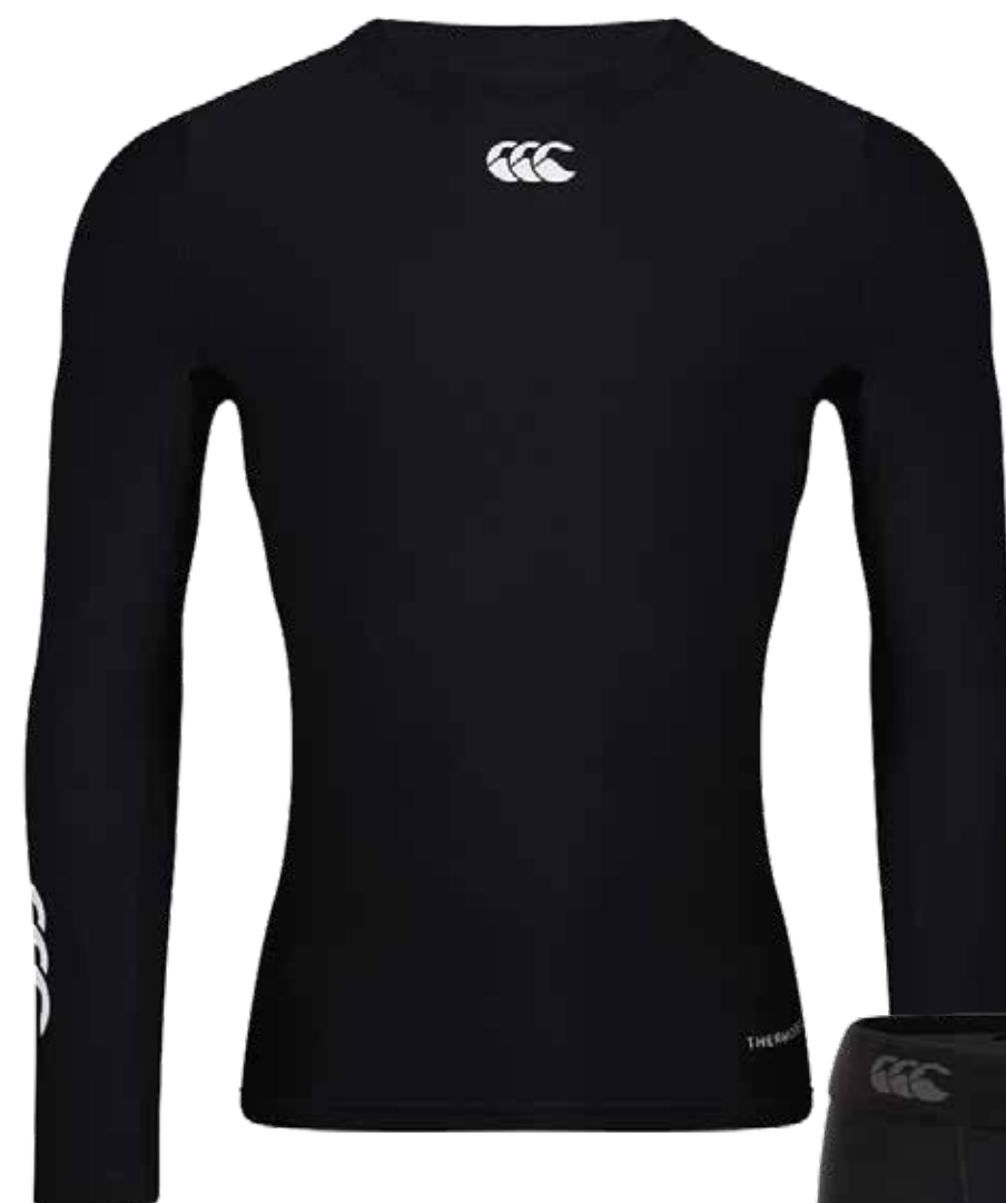
CCC THERMOREG L/S TOP