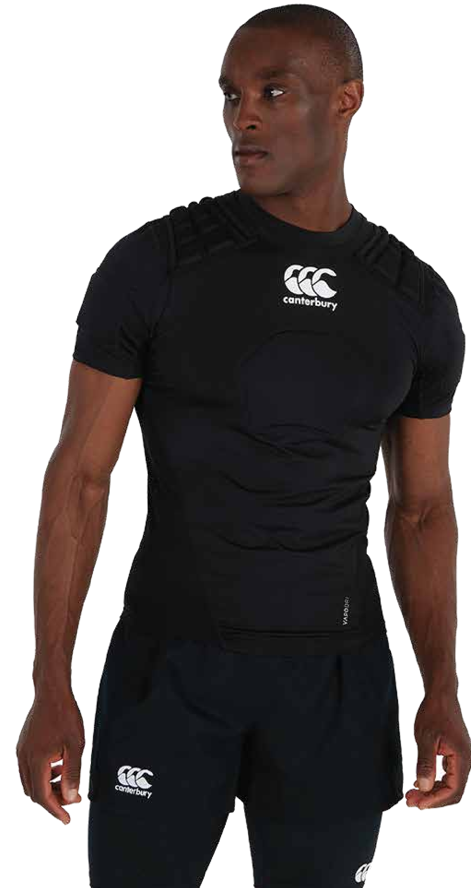
CCC PRO PROTECTIVE VEST