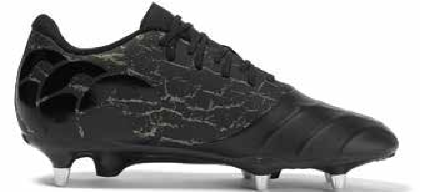
CCC PHOENIX GENESIS TEAM SG AU BLK/GRY SKU: Q-B000136AP7 Retail: $148 CAD