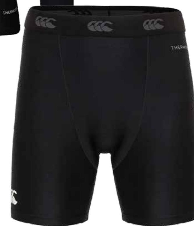
CCC THERMOREG SHORTS