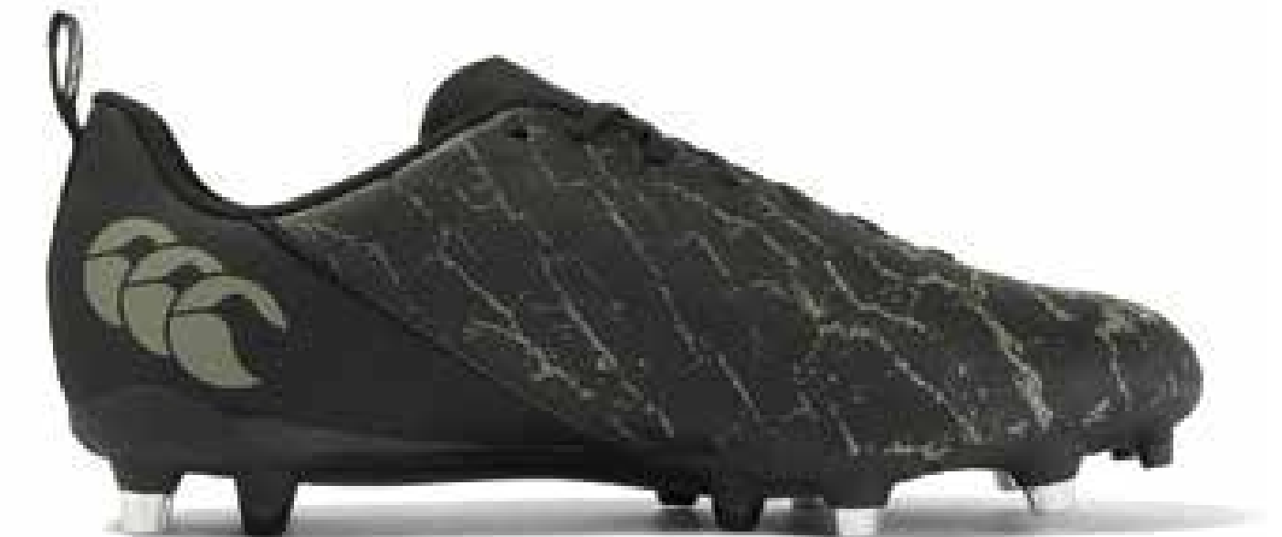
CCC SPEED TEAM SG AU BLK/GRY SKU: Q-B000077AP7 Retail: $148 CAD