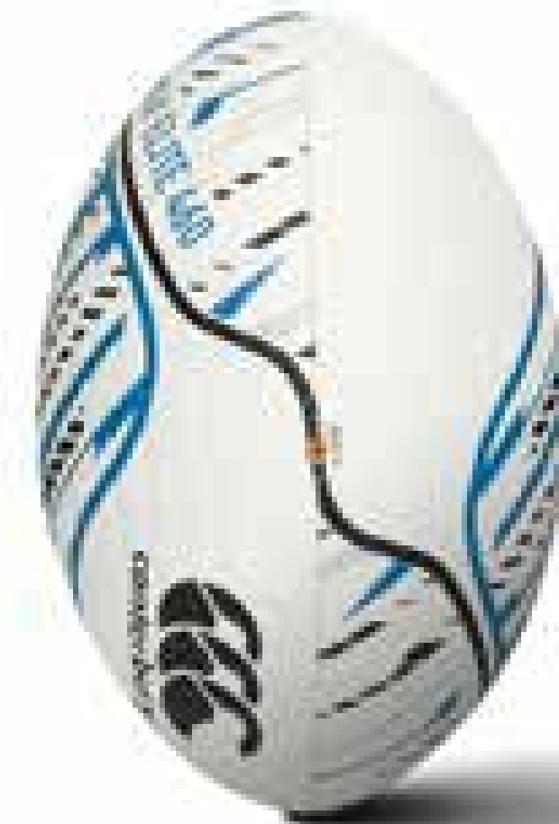
CCC CATALYST XV MATCH BALL