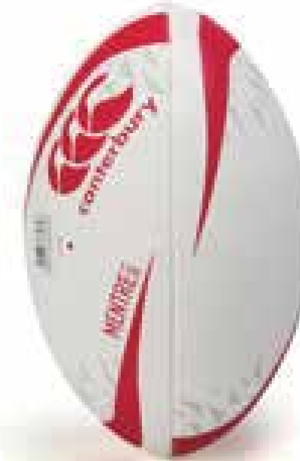
CCC MENTRE TRAINING