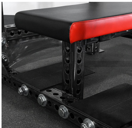
"TAR CLOTH" NO-SLIP BENCH PAD