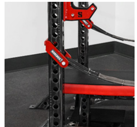
LESS THAN 1" INCREMENT ADJUSTMENTS