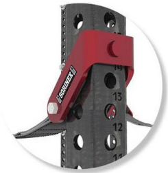
SAFETY STRAP SYSTEM [1 PAIR]