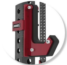
SANDWICH STYLE J-HOOK (2 PAIR)