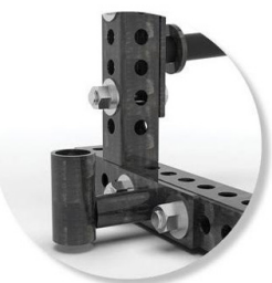
SINGLE BAR STORAGE