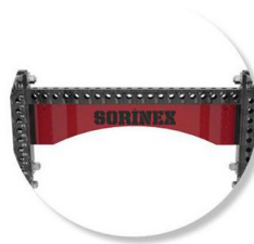
CUSTOM LOGO ARCH