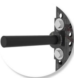
XL SERIES STORAGE PINS (10)