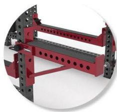
HALF SAFETY BARS (PAIR)