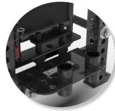
TWO BAR / UTILITY SEAT STORAGE