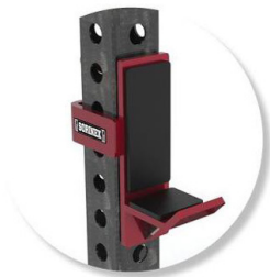
XL STYLE J-CUP