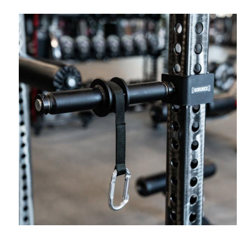
PLATE LOADED DESIGN