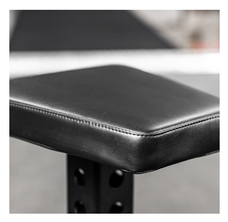
DOUBLE-STITCHED PREMIUM NAUGAHYDE SEAT