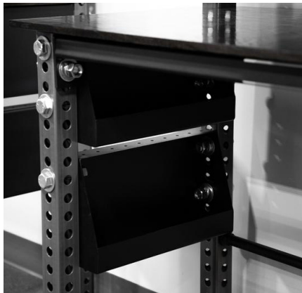
INTEGRATED STORAGE TRAYS