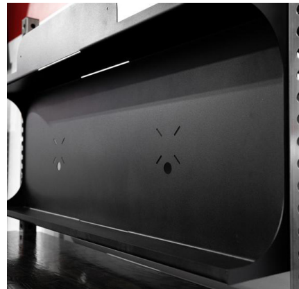
STEEL BACK PANEL WITH DUAL MONITOR ATTACHMENTS