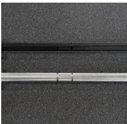
BLACK OXIDE OR BRIGHT ZINC