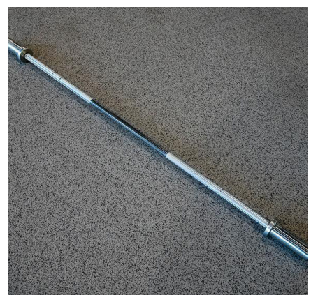
ALSO AVAILABLE IN 10KG AND 15KG