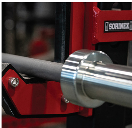
BUILT TO IWF STANDARD