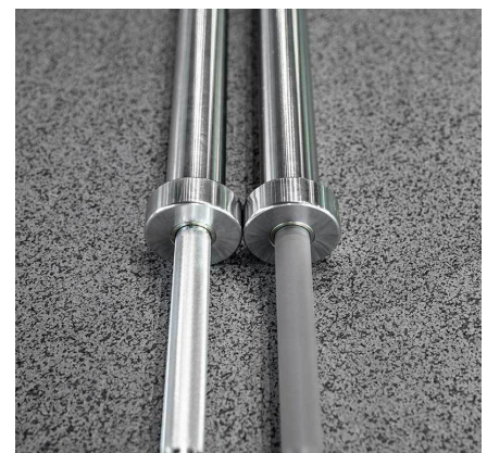
BRIGHT ZINC OR CLEAR CERAKOTE