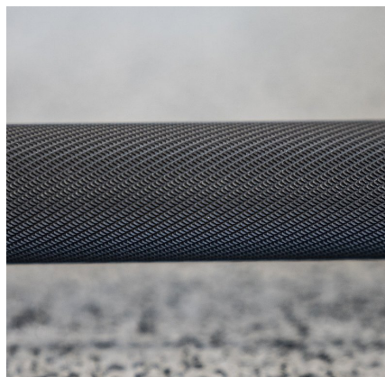
MEDIUM / AGGRESSIVE KNURLING