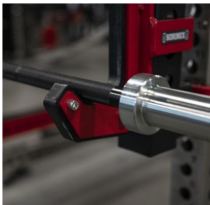
2000 LB STATIC LOAD TESTED