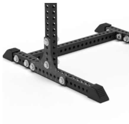
RUBBER STABILIZATION FEET