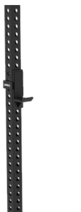
35 HOLES PER UPRIGHT