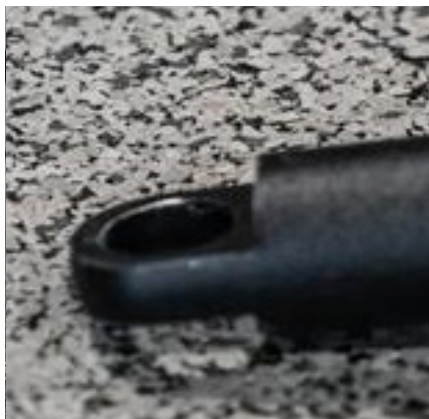
MODULAR ATTACHMENT POINTS