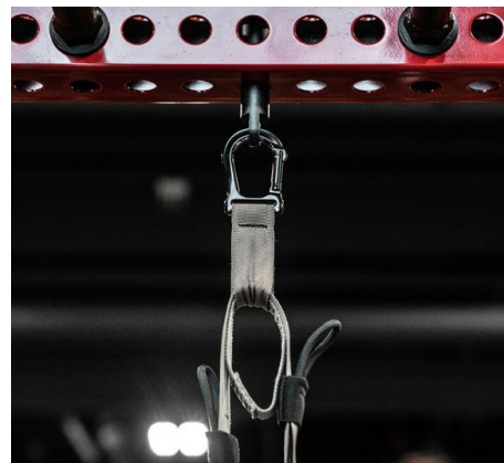
UTILIZES FIRST 4-WAY HOLE DESIGN