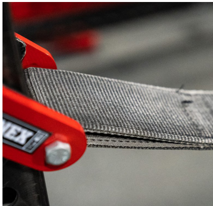
SECURE SELF-LOCKING DESIGN