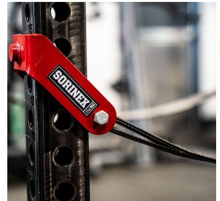
3/8" STEEL PLATE