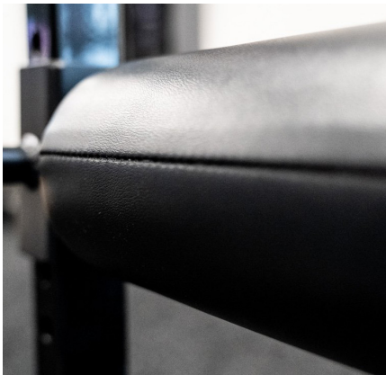
NAUGAHYDE LEATHER ROLLER