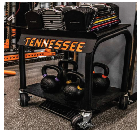
WIDE OPTION AVAILABLE