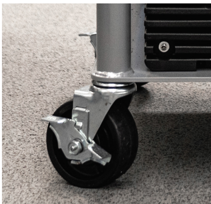
LOCKABLE HEAVY-DUTY WHEELS