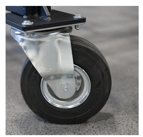
LOCKABLE HEAVY-DUTY WHEELS