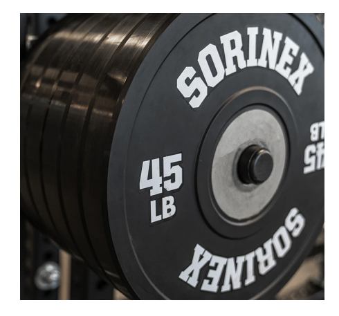
16" SLEEVE URETHANE STORAGE PINS