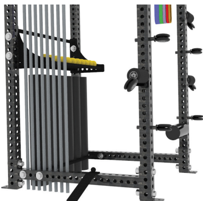
CALF / PLANTAR FASCIA STRETCHER, TRIGGER ROLLER / BARS, PVC HURDLE PIPES