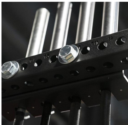
COMPATIBLE WITH ANY 3" X 3" RIG WITH 1" HOLES AND APPROPRIATE SPACE