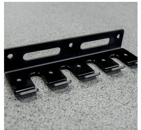
UHMW PLASTIC LAYER