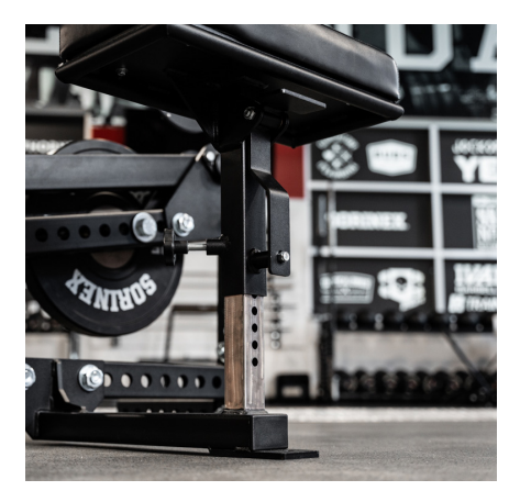
ADJUSTABLE SEAT WITH HANDLES