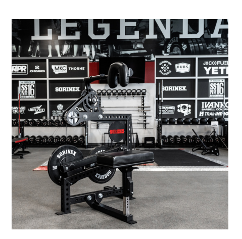
COMPACT FOOT PRINT