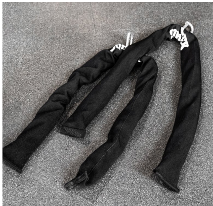
45 LB LOAD EACH