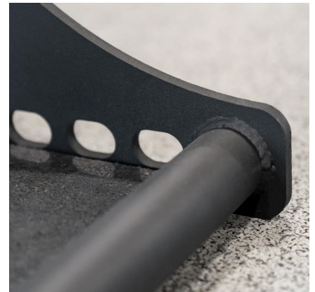
WELDED 3/8" FLANGES WITH LIFETIME STRUCTURAL WARRANTY