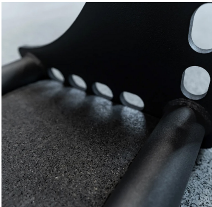
RUBBER INLAY TO PREVENT STEEL ON STEEL CONTACT