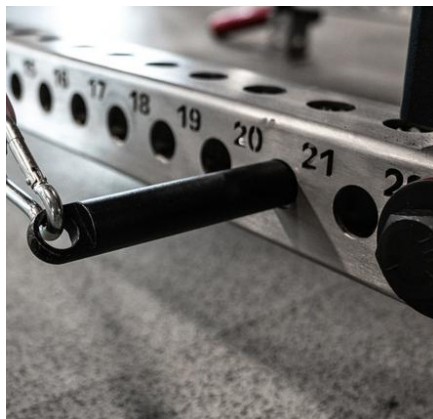
UTILIZES FIRST 4-WAY HOLE DESIGN