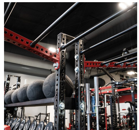
OUTRIGGER TO RACKS