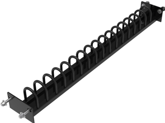
BUMPER / PLATE