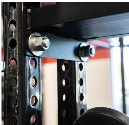
EXPANDABLE HEIGHT & CONFIGURATIONS