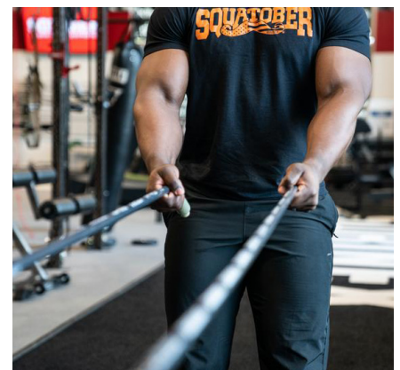
CAN WITHSTAND UP TO 600LBS OF TORQUE