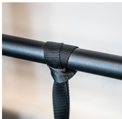
DURABLE NYLON RAIL STRAP