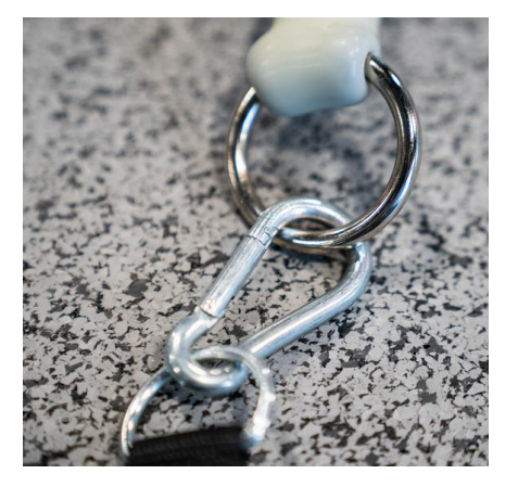
DOUBLE REINFORCED O-RING ON THE ANCHORING END