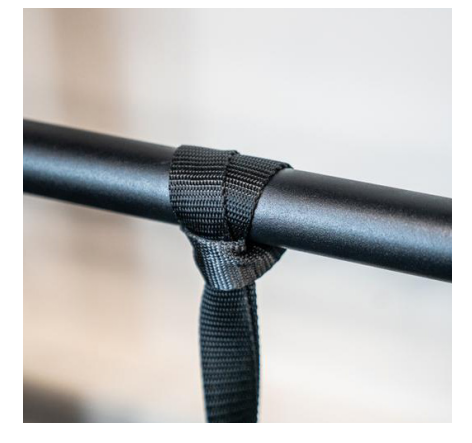
DURABLE NYLON RAIL STRAP