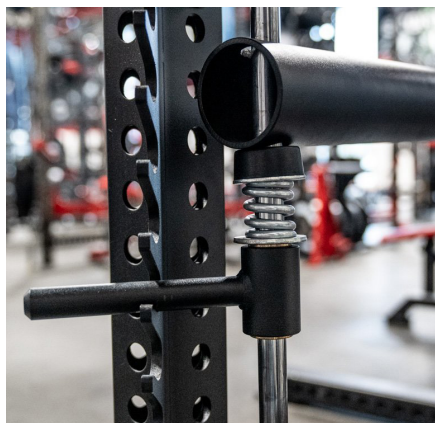
SPRING LOADED SPOTTER ARM