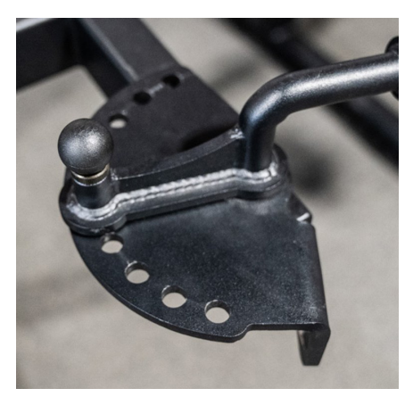
ADJUSTABLE KNURLED HANDLES