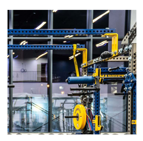
CUSTOM COLOR OPTIONS