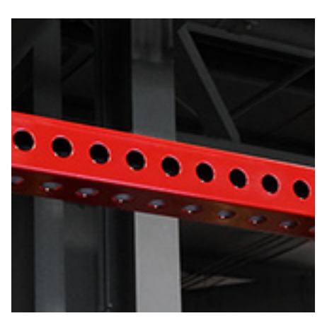
4-WAY HOLE DESIGN