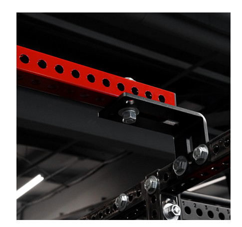
LASER CUT AND BENT 1/2" THICK STEEL BRIDGE EAR CONNECTORS