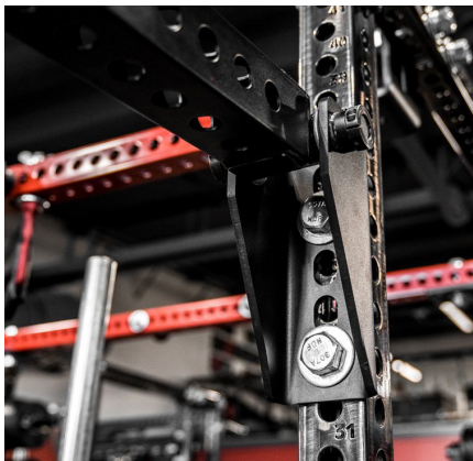
SECURED WITH 1" COLD ROLLED STEEL BOLTS